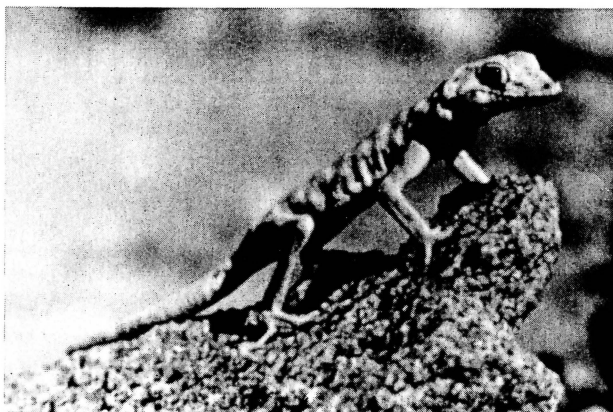
PLATE 3: Rhotropus afer in the "breezing" position.

so as to maximize the cooling effect of the breeze, namely by assuming a position \pm perpendicular to the wind direction. The importance of wind direction and velocity with respect to the position of a lizard in exchanging energy by convection with the surrounding air has been illustrated by using a metal (silver) lizard model (Bartlett and Gates, 1967).